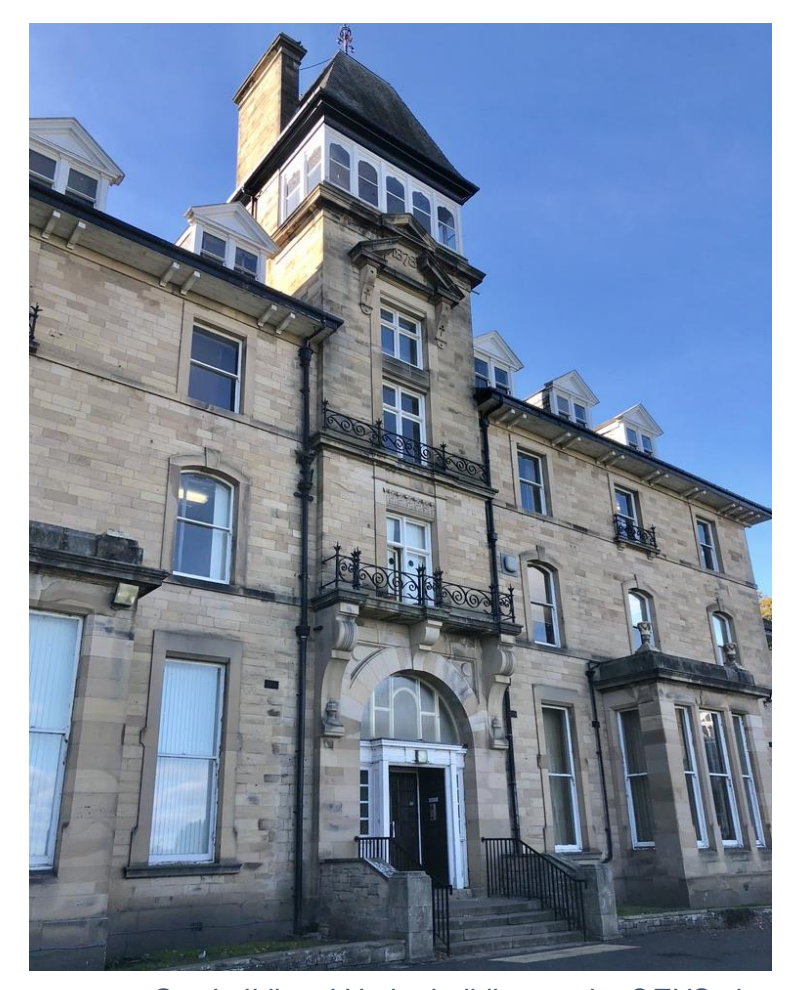
Grade II listed Hydro building on the QEHS site, which would be retained and refurbished.

We are keen to hear the views of as many of you as possible. Please complete the online <u>Response Form</u> to help minimise administration costs.