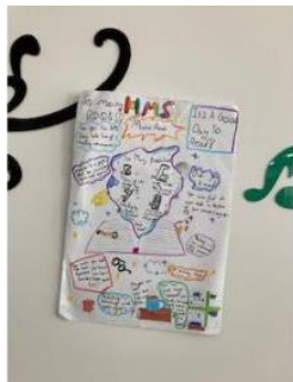
1 st : Clara H (Y6)