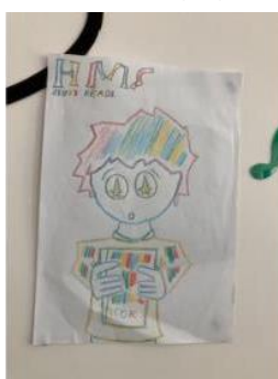
2 nd : Wilf C (Y6)